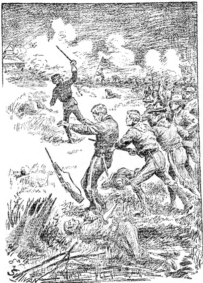
"Forward! Guide Right" Shoot first in the fight"